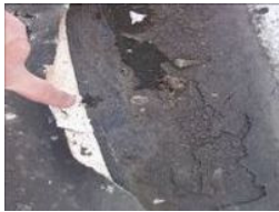
Roof Coating Failures