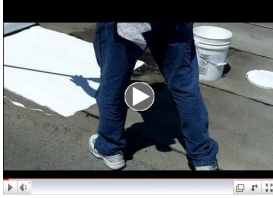
Roof Repair Video