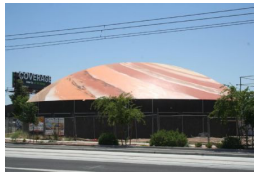
Robert L. Duffy HS "Future Stars Begin Under Our Domes"